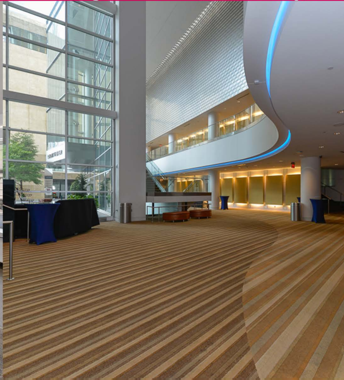
Knight Theater (Main Lobby)