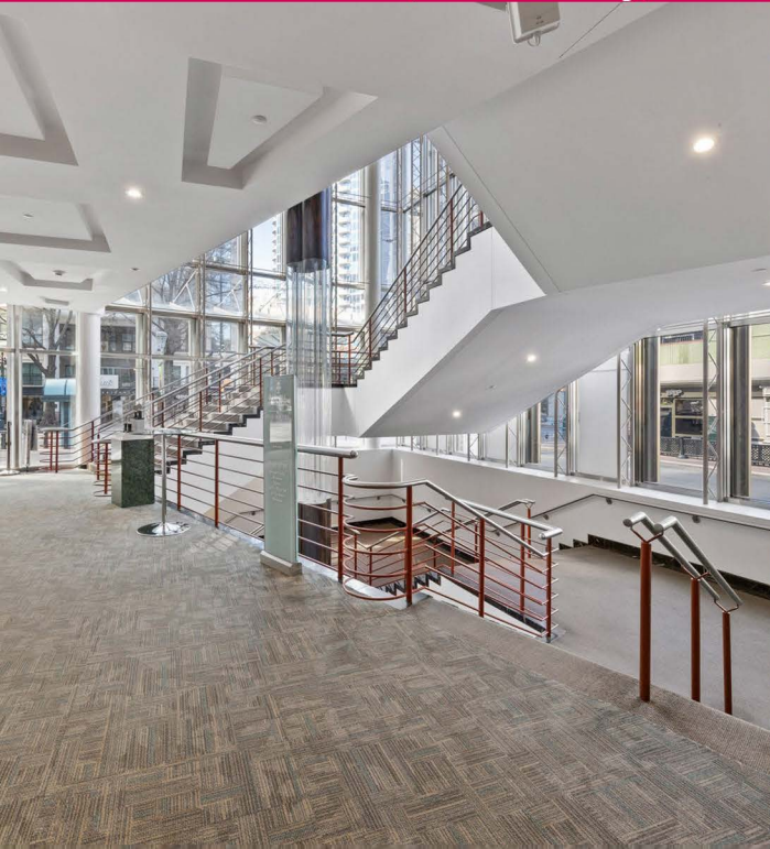
Belk Theater (Main Lobby)